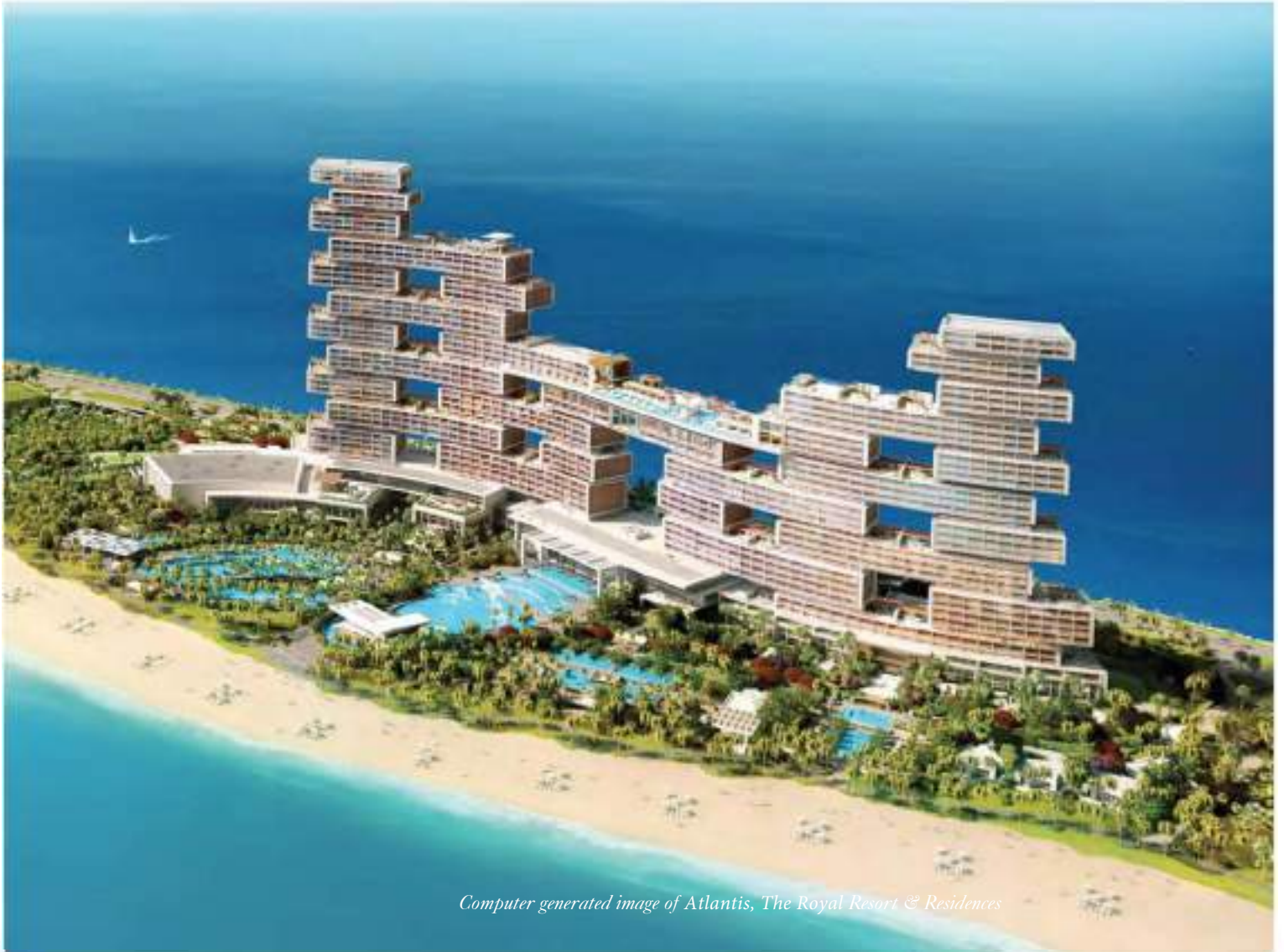
Computer generated image of Atlantis, The Royal Resort & Residences